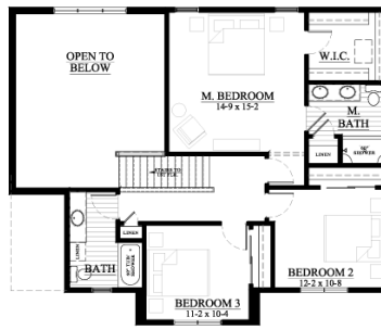
SECOND FLOOR LAYOUT